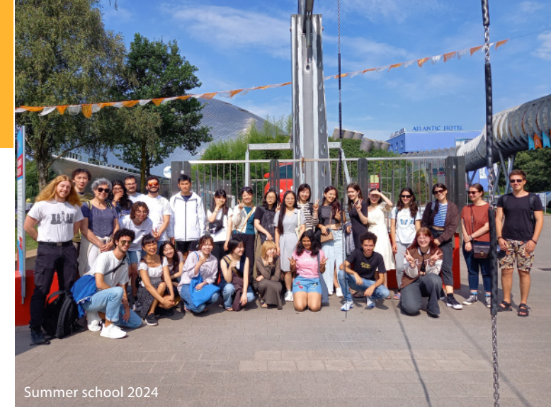
Summer school 2024